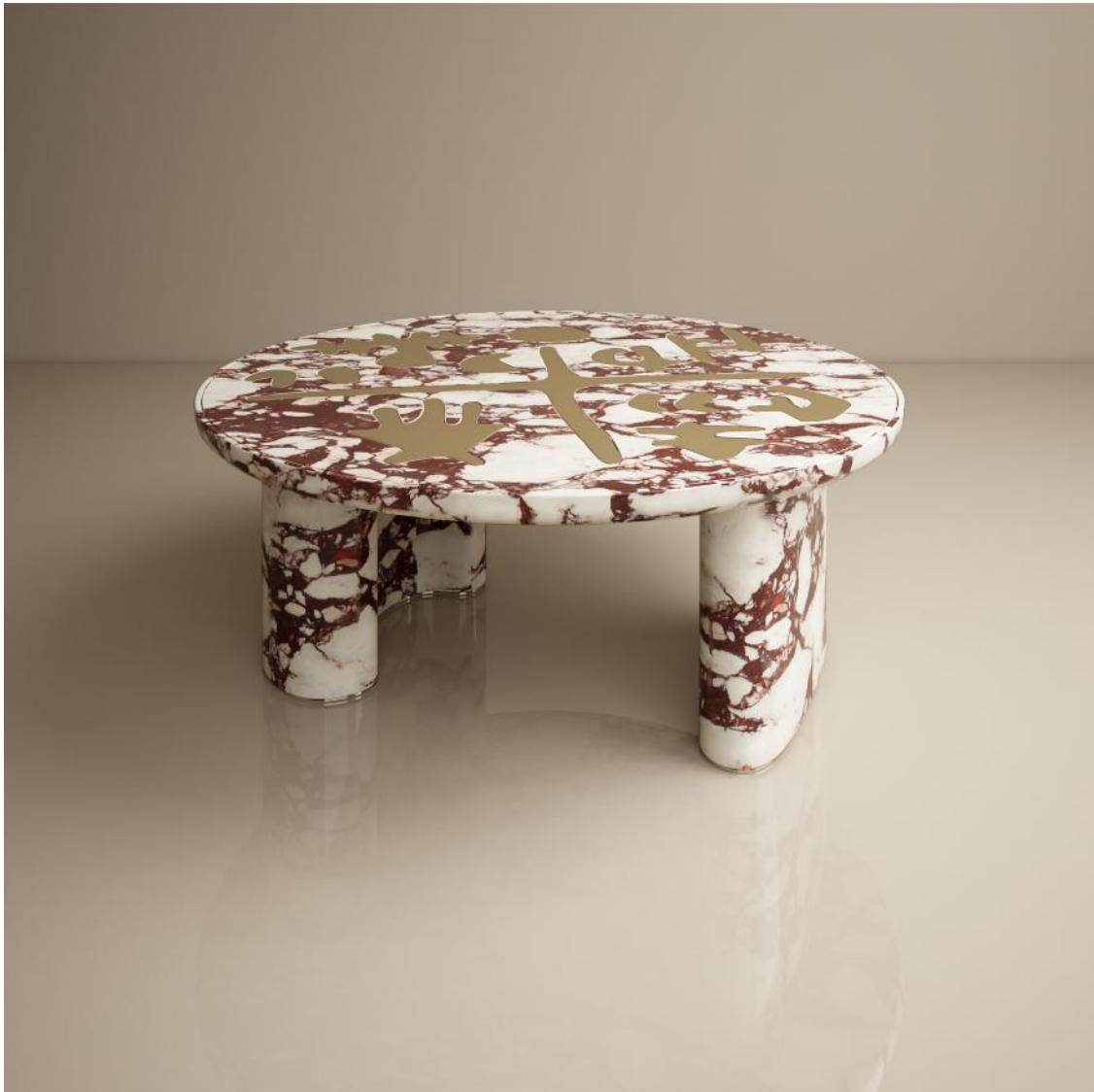
JMM_CT1 CV | CENTER TABLE