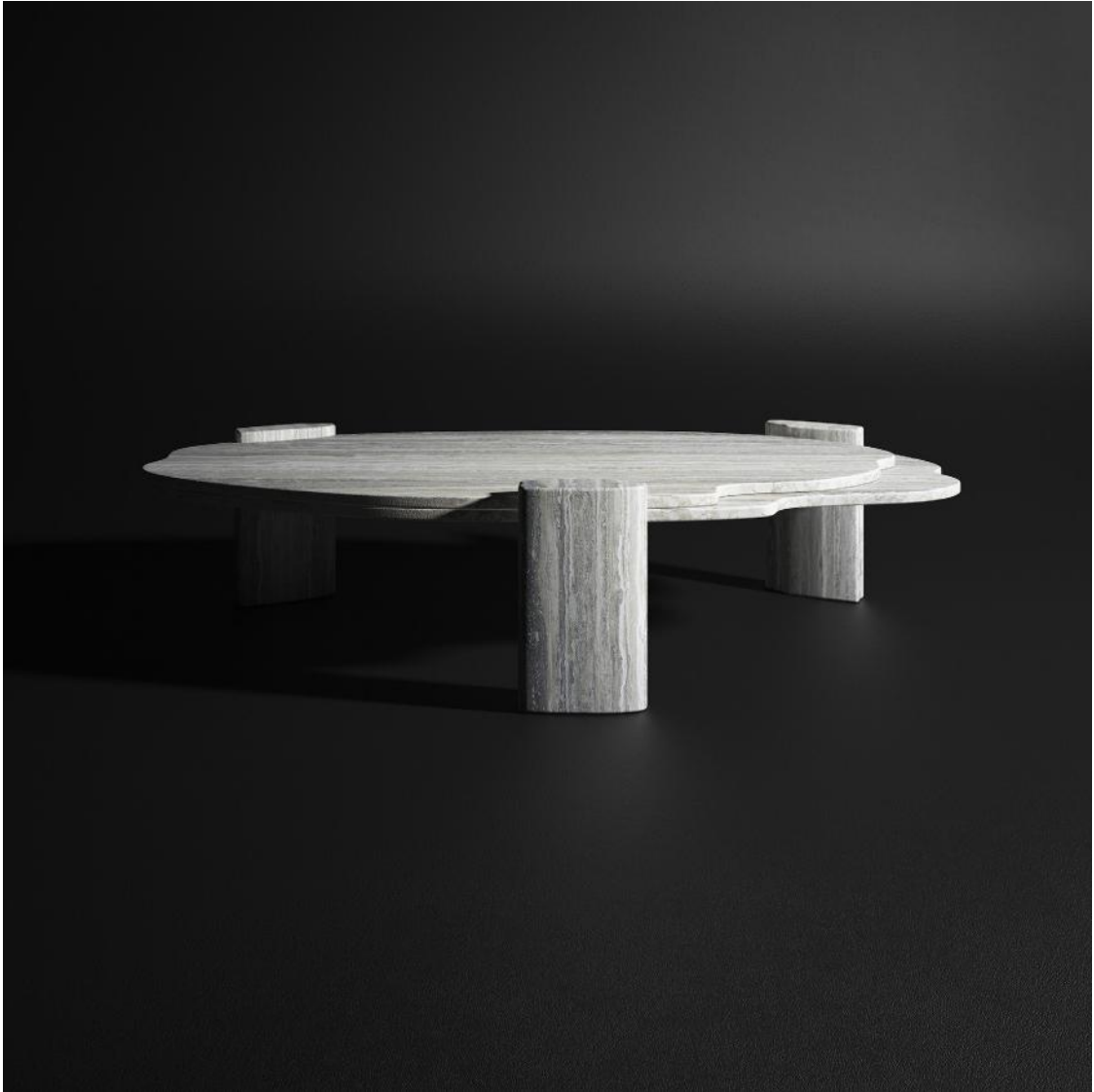
JMM_CT2 | CENTER TABLE